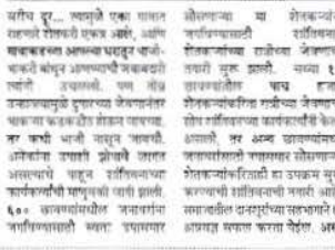
वीडच्या शांतितानात दुष्काळविरोधी अन्नयज्ञ आयोजित करण्यात येईल.

मुंबई: जगविणाऱ्या शेतकऱ्यांच्या उपासमारे टक्ळी घालण्यात येईल. वीडच्या 'शांतिताना'त दुष्काळविरोधी 'अन्नयज्ञ' आयोजित करण्यात येईल. छावण्यांमध्ये पाच हजार जणांची व्यवस्था करण्यात येईल.